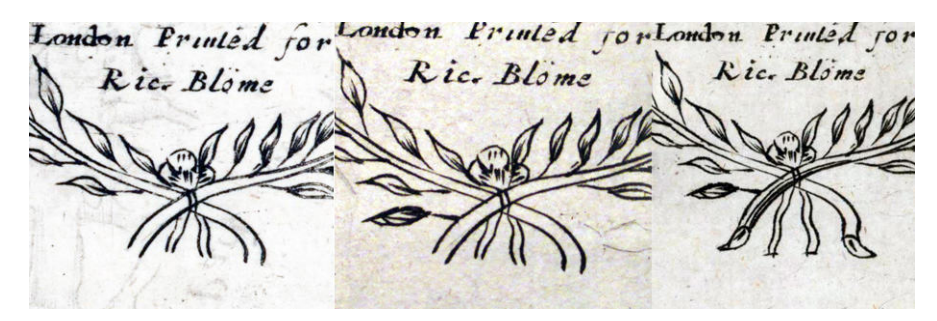
State 1 (left): Stem ends are open and there is no leaf below the tie. State 2 (center): Stem ends are open and a leaf has been added to bottom left stem. State 3 (right): The stem ends are now closed.

Previously published cartobibliographies have been consistent in reporting a single state of the Carolina map. A review of images located on the internet reveals three states of the map among surviving copies. The changes are minor and relate solely to the bottom of the title cartouche as illustrated below: